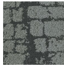
Wild 05557 LRV 12.2