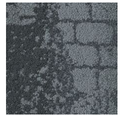
Calm 05580 LRV 11.1